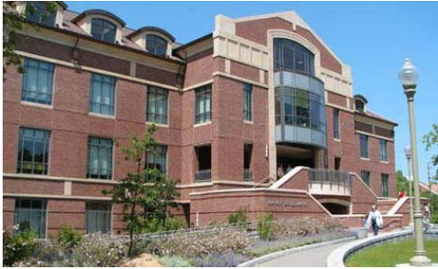
Santa Rosa Campus Doyle Library, Room 4251